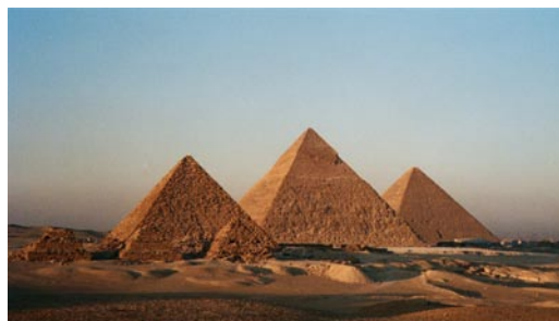
The Great Pyramids of Giza, Egypt